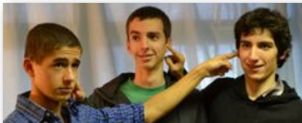
The Yearbook Committee

The committee will be more than glad to receive from the terminale parents any comments and suggestions they might have at the following address: rosario intersec@hotmail.com