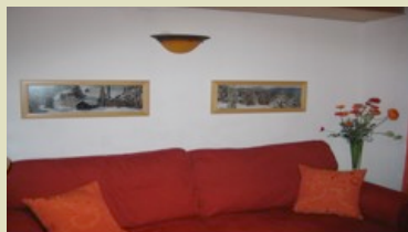
Living Room with Pull-Out Couch (IKEA Double)